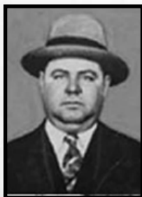
AL "SCARFACE" CAPONE

Patrick Alexander describes 19 of Miami's more colorful murders, from the 21 st century to the late 19 th century, to be accompanied by a glass or two of ' 19 Crimes ' blood red wine.