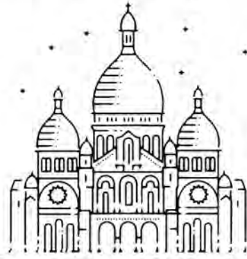
Sacre Coeur Cathedral