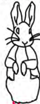
Step 6: Then, draw the leg.