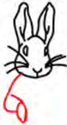
Step 3: Then, draw the hand.