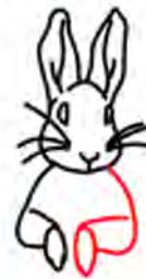
Step 4: Draw the other hand.