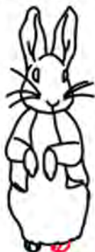
Step 7: Draw the other leg.