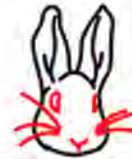
Step 2: Next, draw the face.