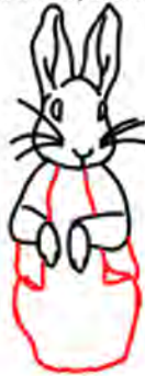
Step 5: Draw the body.