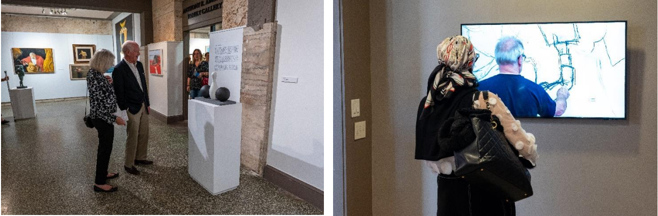
Julio Larraz: The Kingdom We Carry Inside Exhibition Visitors at the Coral Gables Museum.

Artist Julio Larraz (b. Havana, Cuba, 1944) is one of the most influential figures in Latin American art today. Throughout a career of six decades, institutional recognition has gone hand in hand with the admiration and following of colleagues and many younger painters from all over the world that praise his mastery of technique, color and light, and the poetry and subtlety of his work.